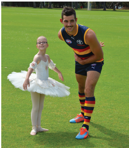
Variety – The Children's Charity $50,000

The Variety Show of Hearts Scholarship program assists children who are sick, disadvantaged or have special needs to fulfil their talents in the field of sport, the arts and education. Previous recipients have gone on to represent Australia in the Paralympics and have performed in leading National musicals. We enjoyed sharing the individual journeys of some of this year's 27 scholarship children,