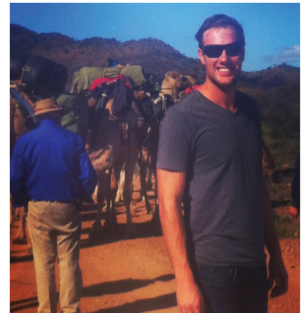
Operation Flinders $16,500

Our third charity partner, Operation Flinders, take 'at risk' youth into an isolated environment where self-discipline, cooperation, leadership, teamwork and trust are intrinsic to survival. The Foundation's funding supported 10 children in the Operation Flinders March camp, trekking through the Flinders Ranges for 8 days. Upon the students return a graduation ceremony was held here at the Club, participants were full of praise for the program and parents amazed at the life changing results.