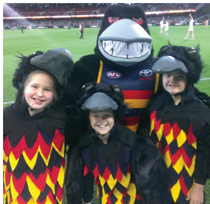
Down Syndrome SA $15,000

Several scholarship students also took part in our pre match entertainment by performing as our 'Little Chicks' for the day, thank you for making our match days so rewarding.